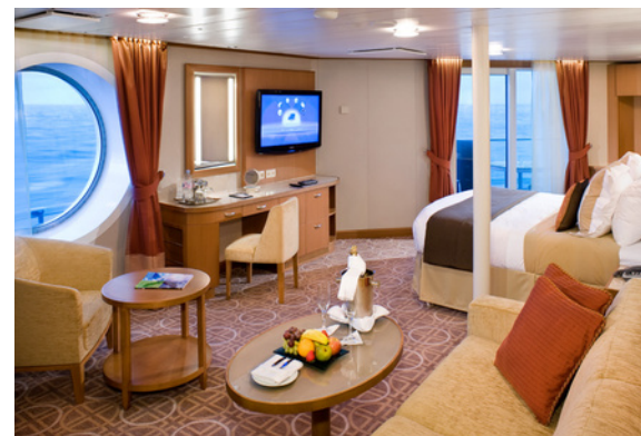
The diagram above displays layout for S2 Sky Suite. The photo on the left is an example of a S1 Sky Suite.

Stateroom images and features are samples only. Actual furniture, fixtures, colors and configurations may vary. All measurements are approximate; drawing not to scale.